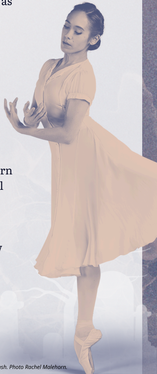
Lahna Vanderbush.

This production is rated 16+ due to scenes of gun violence and other potentially distressing imagery.